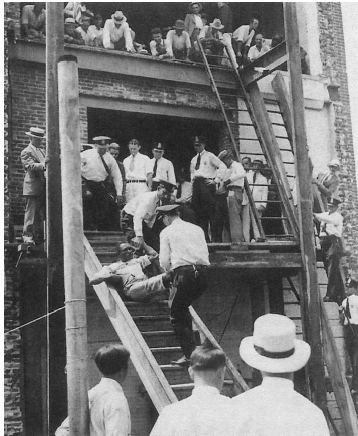
A veteran being pulled out of a building by police during the Bonus March.

13 Study the photograph, and then answer the questions which follow.